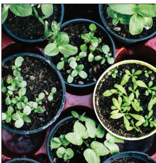
An herb garden.

Saturday, August 5, 2023 at 10 AM – 11 AM, the Raynham Hall Museum is hosting a Workshop: The Practical Herb Gardener.