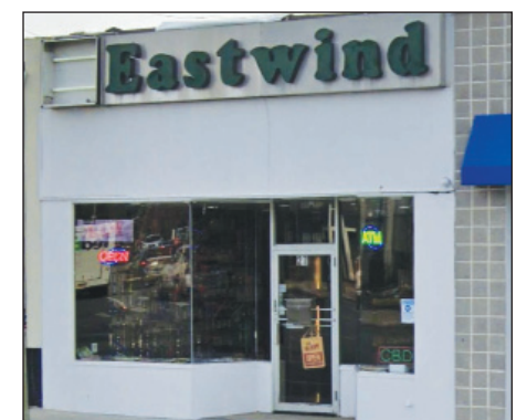
The busted East Wind Exotic Vape Shop.

More recently, the owner was charged with selling a drug-laced chocolate, with a marijuana ingredient in it. He was charged with Criminal Sale of a Controlled Substance 5th Degree and