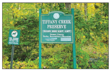
Tiffany Creek Preserve, Sandy Hill Road.

Pickleball is the fastest growing sport in America today; easy to learn, but hard to master. "Pickleball is Life" will take readers from the sport's unorthodox origins through its current craze.