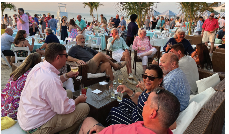
Enjoying great food, cold drinks and good friends.