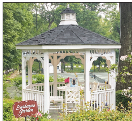
The new gazebo overlooking the tennis courts.

As you drive past the Locust Valley Library, you may notice a beautiful white gazebo sitting up on the hill above the