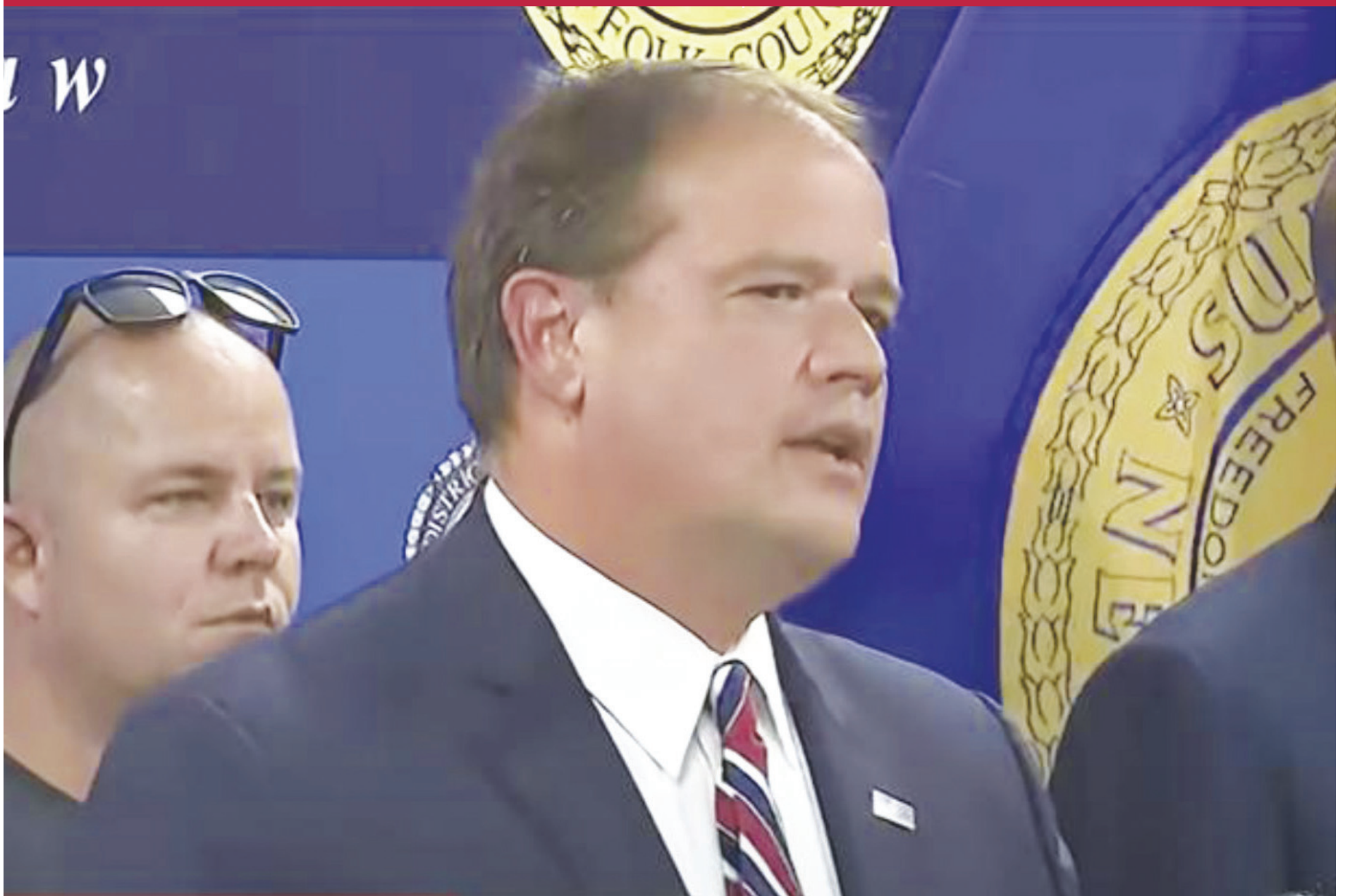
The 13-year old Gilgo serial-murder case, went from "cold case" to "mass murderer arrested". Story on page 3.