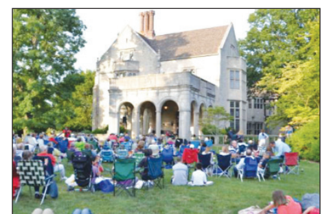
A concerts on the west lawn.

Planting Fields is currently open from 9:00 AM – 5:00 PM, 7 days a week. Parking fee is $8. The Visitor Center in Coe Hall is open Wednesday through