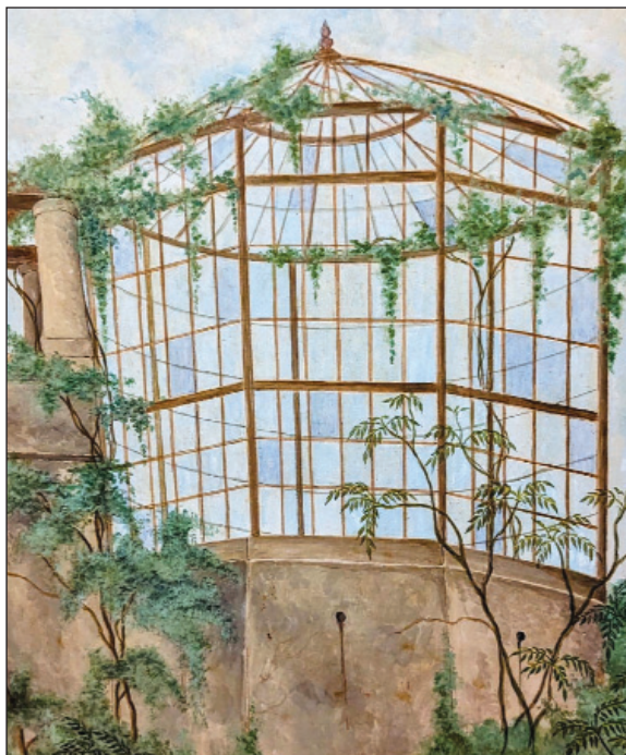
Laurelton Hall Ruins