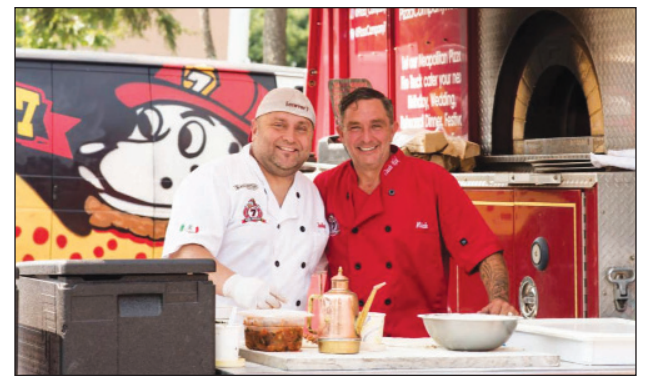
Everyone's favorite food truck, Pizza Company 7, will be there.

Morgan Park Summer Music Festival is an all-volunteer nonprofit organization. The high-caliber professional concerts offered each summer are free to the public and are completely funded through