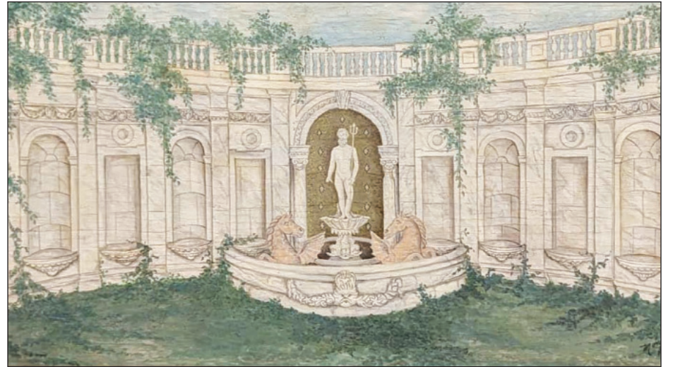
The Neptune Fountain at Winfield