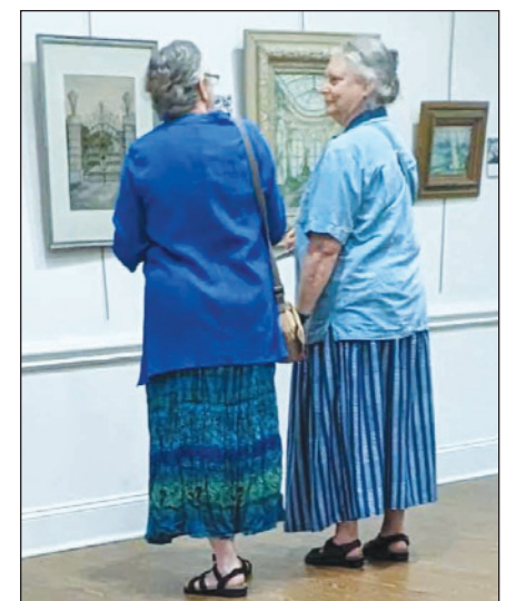
Two guests admiring the art