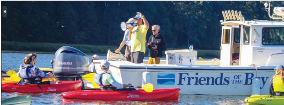
Last year's Kayak Conservation Cruise

Friends of the Bay and The WaterFront Center are again partnering for a Kayak Conservation Cruise on Saturday, July 22, 9 a.m. to 11 a.m. (Rain date: July 23), the first of two cruises of the year.