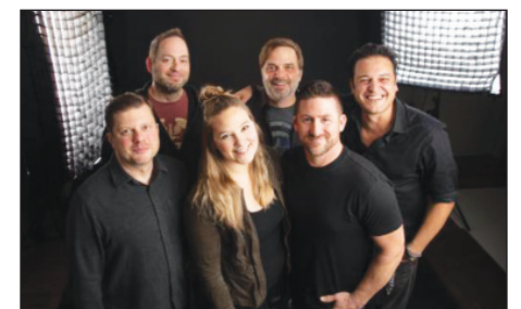
Peat Moss and the Fertilizers

Sunday 9:00 AM – 5:00 PM. The Main Greenhouse and the Camellia Greenhouse are open 10:00 AM – 4:00 PM every day except Tuesday.