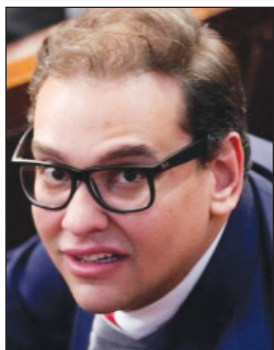
George Devolder Santos

Only four (4) of the alleged new donations came from inside New York's Third congressional district. Of the others, most were from distant places like California - in the exact maximum donation of $3300 - with the donors' occupations being listed as “Student,” “Housewife” and “Part-Time Job/Cashier.”