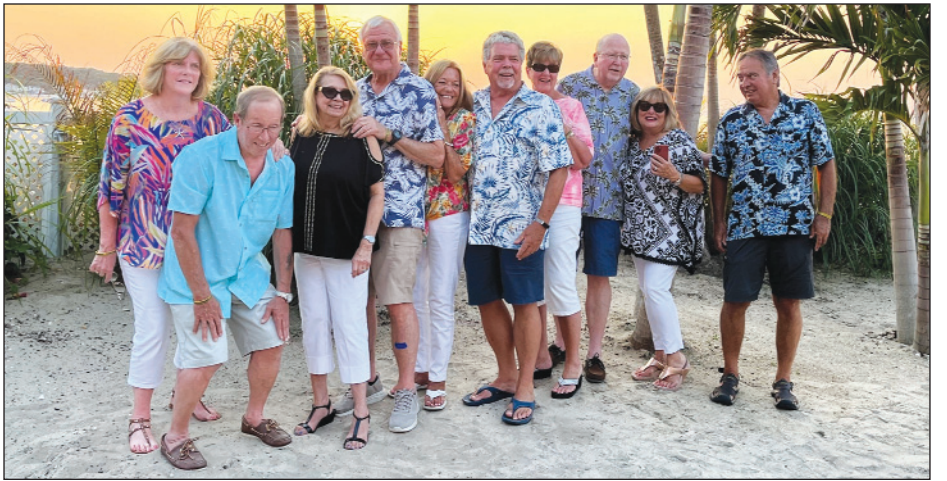
Beautiful Bayville sunsets, a great backdrop for photos.

The Bayville Chamber of Commerce held thier 7th Annual Clam Bake at the Crescent Beach Club. The event was well attended, and it was a great summertime party with many friends and family.