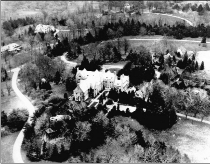
Killenworth ariel view. Circa 1950.

Therefore, I typically utilize precious periods to compose bygone Long Island country estate related articles while lounging peacefully by the fireplace with its relaxing, delightful warmth radiating comfort. It's also enjoyable digging up the past, undertaking research and then