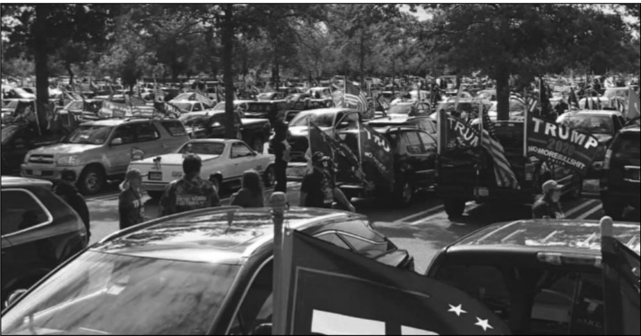
It was a beautiful day for a peaceful parade.

Over 3,000 participants turned out for a Trump Rally car and truck parade this past Sunday, that began in East Northport in Huntington, and traveled over 60 miles to end in Riverhead.