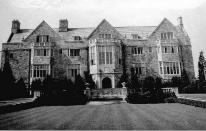
Circa 1925. Front facade of Killenworth.