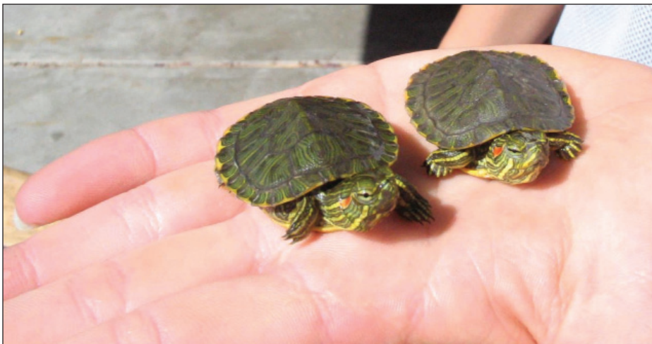
Baby turtle hatchlings.