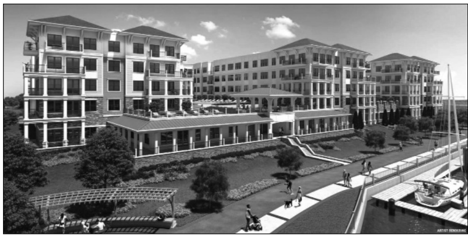
A rendering of the Garvies Point development.

RXR, the developer of the Garvies Point development in Glen Cove, has filed amended plans with the Glen Cove Planning Board, for the final stages of the development.