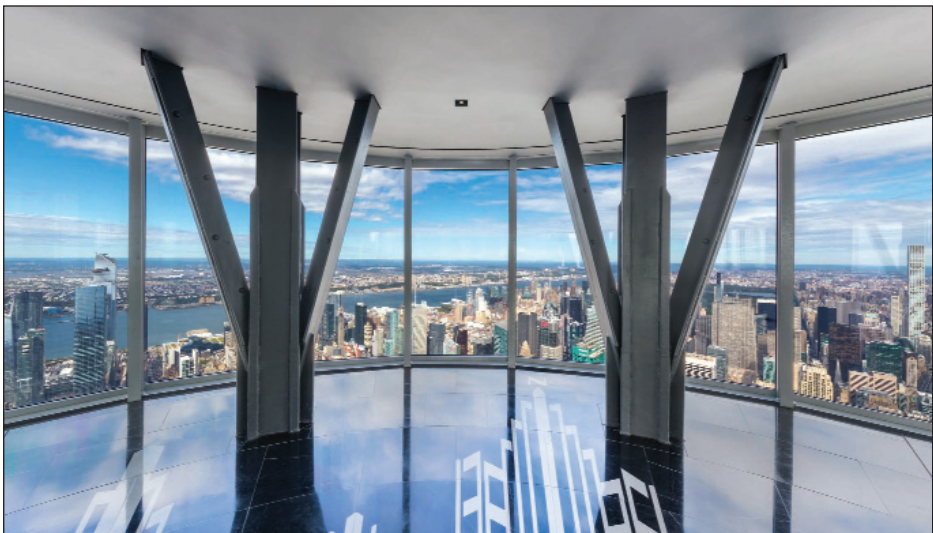
360-degree view from the Empire State Building's 86th floor.