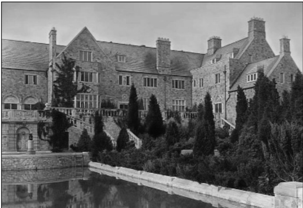
A back view of Killenworth

(Continued from page 6) said smiling, a few choice Russian words which hopefully meant “welcome” and not “frisk him”, or possibly even worse. He then waved to uniformed security guards within the grounds and the wrought iron entrance gates were promptly opened wide. Two large estate protectors swung back the iron gates in order for us to continue along the winding roadway through the compound. During the next three hours, I would find myself on the same foreign territory which, at that time, many local newspaper articles had reported that top secret electronic spy equipment was being utilized daily. Newsday announced that there was spying from the mansions upper floors which overlooked the nearby Long Island Sound and onto distant shorelines. There was no way of knowing what the Soviets hoped to view, gather from the surrounding neighborhood or even from out upon the blue waters. Were they tapping into, sending various clandestine communications, hacking and receiving a secret assortment of