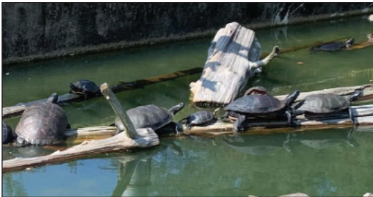
Adult turtles basking in the sun on cedar logs.

The baby turtle experience, which lasts about 20 minutes, allows for a personal meet-and-greet with the baby tur-