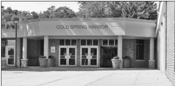
Cold Spring Harbor High School