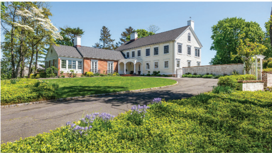
629 Bayville Road, Lattingtown, NY