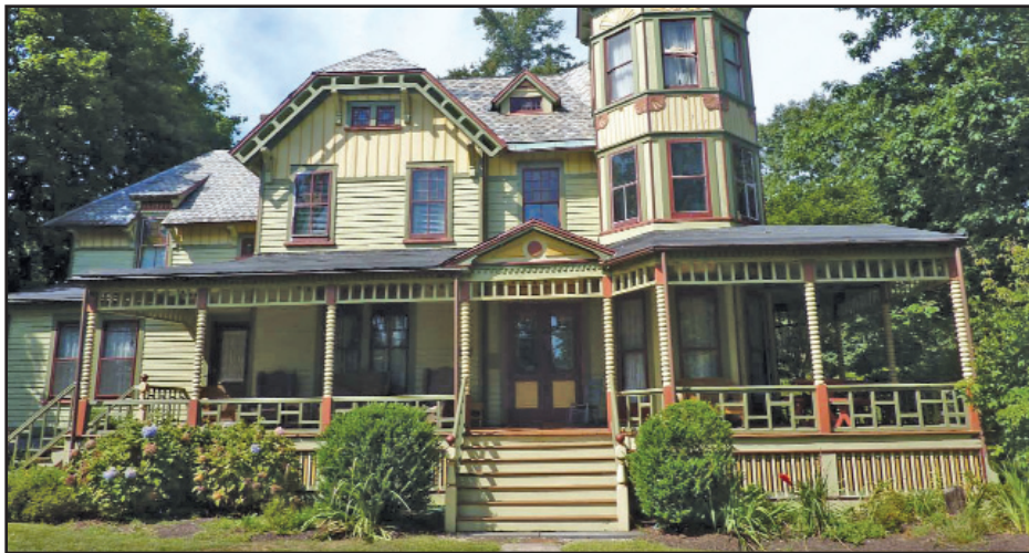
Sea Cliff’s Porches to be filled with bands