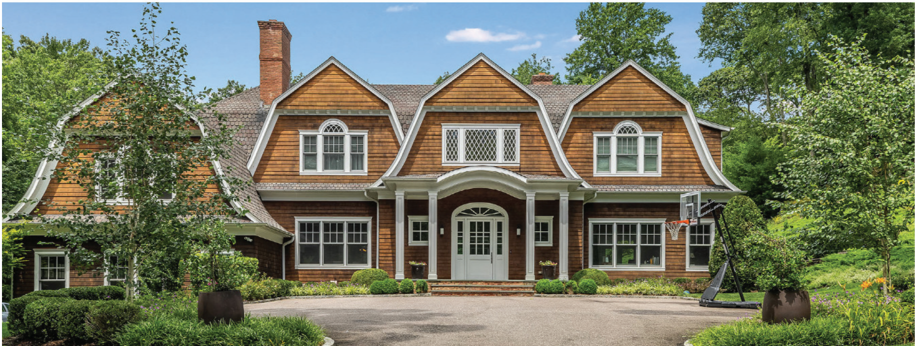
190 Sunset Road, Oyster Bay Cove, NY