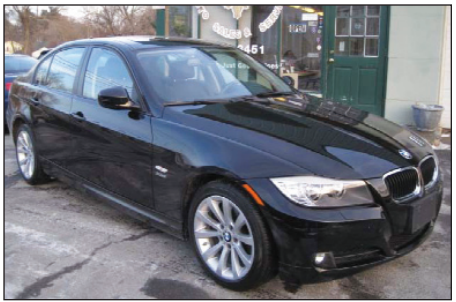
2011 BMW

By NOLAN CLEARY Police in Nassau County are on the hunt for group of brazen car thieves who stole a running black 2011 BMW from a gas station in Syosset. On the early morning of Tuesday, April 26th at the BP gas station located at 200 South Oyster Bay Road in Syosset, the thieves grabbed the BMW, as the owner was paying for gas. The owner of the car, a 35 year old man, briefly left the vehicle unlocked and running as he entered the gas station around 4:43 AM to pay. But a group of