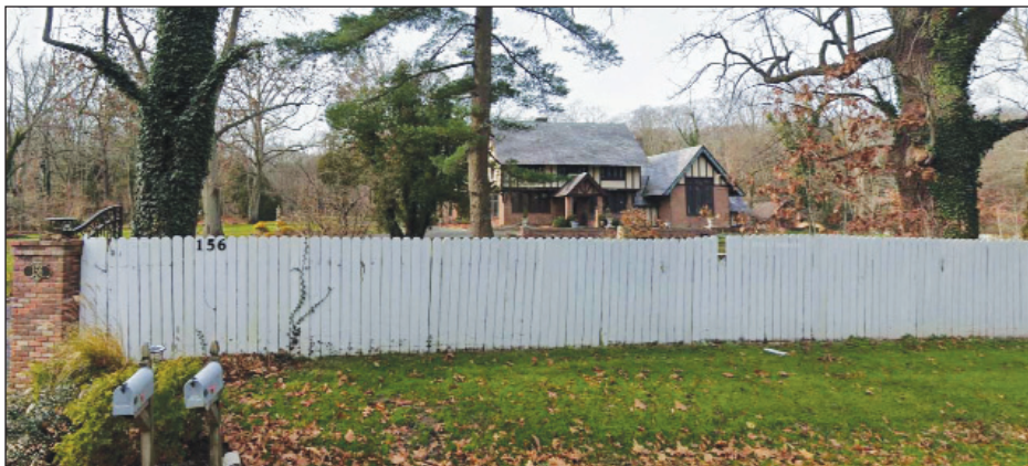
156 Cove Road in Oyster Bay