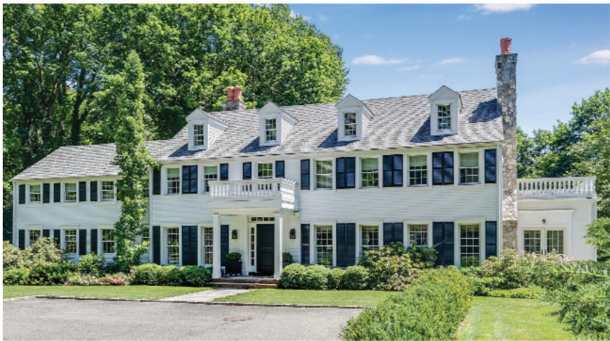
308 Duck Pond Road, Matinecock, NY