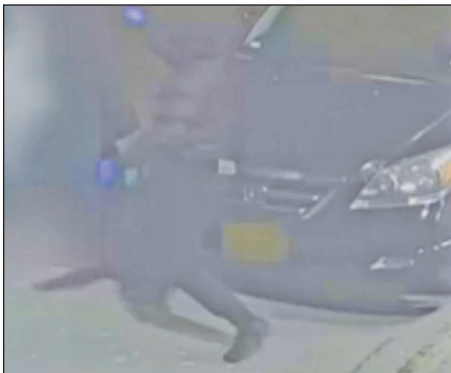
Police Photo of the Fatal Killing If convicted, each defendant faces a mandatory sentence of life in prison, or the death penalty.