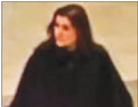
The Thief at Saks solving this grand larceny case. Suffolk County Crime Stoppers is offering a cash reward for information leading to an arrest. Tips can be submitted by calling 1-800-220-TIPS.