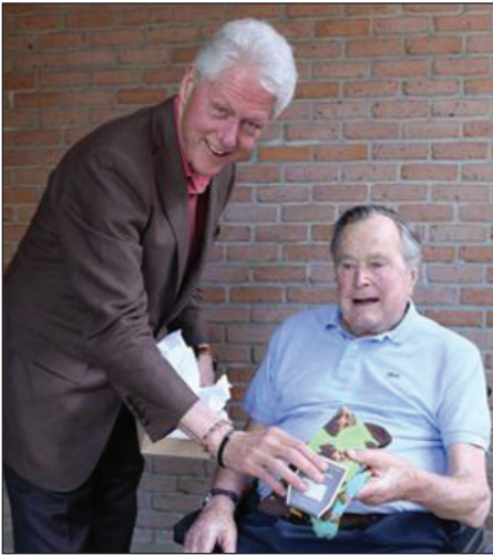
Former Presidents Bill Clinton, and George H. W. Bush with John’s Crazy Socks.