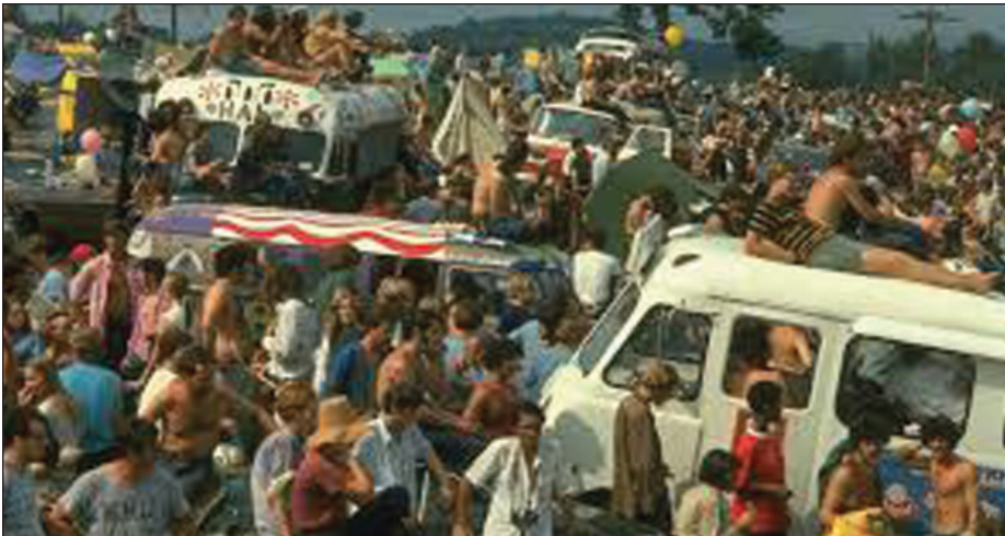
A photo from Woodstock 1969.

On Thursday, August 22nd, at 6:30 PM the Bayville Free Library is hosting “Back to the Garden: The 50th Anniversary of Woodstock”