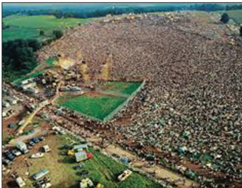
Max Yasgur's farm in Bethel, New York.

sound clips from media broadcasts about the “Three Days of Peace