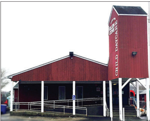
The Glen Cove Child Day Care Center

Per Gillibrand's office, Head Start provides child development programs for low-income children, as well as supports and services for their families. Head Start programs primarily serve children from ages three to five. The programs offer early education, health screenings, social and emotional health, nutrition, social services and services for children with disabilities.