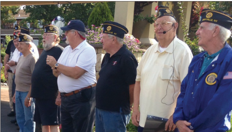
Members of the Robert Spittel Post 1285 of the American Legion.