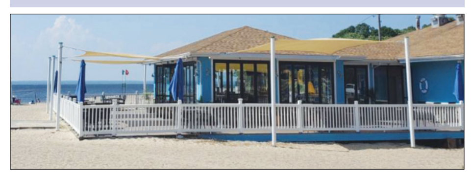
The former Blu Iguana on Tappan Beach