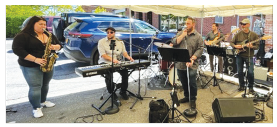
The Band Face to Face entertained the crowd.

Stop by the deli their service and food never disappoints.