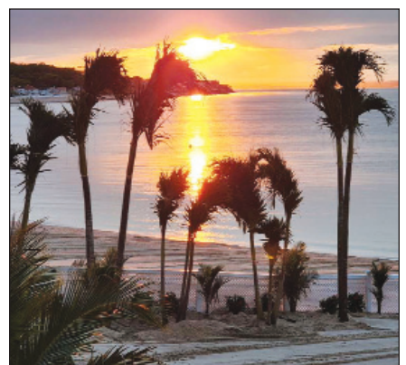
A beautiful sunset on the Long Island Sound.

Ladies Night Out at the Crescent Beach Club was a great success for the Boys & Girls Club of Oyster Bay/East Norwich Bahnik Youth Center. There were thirteen Boutique vendors featuring