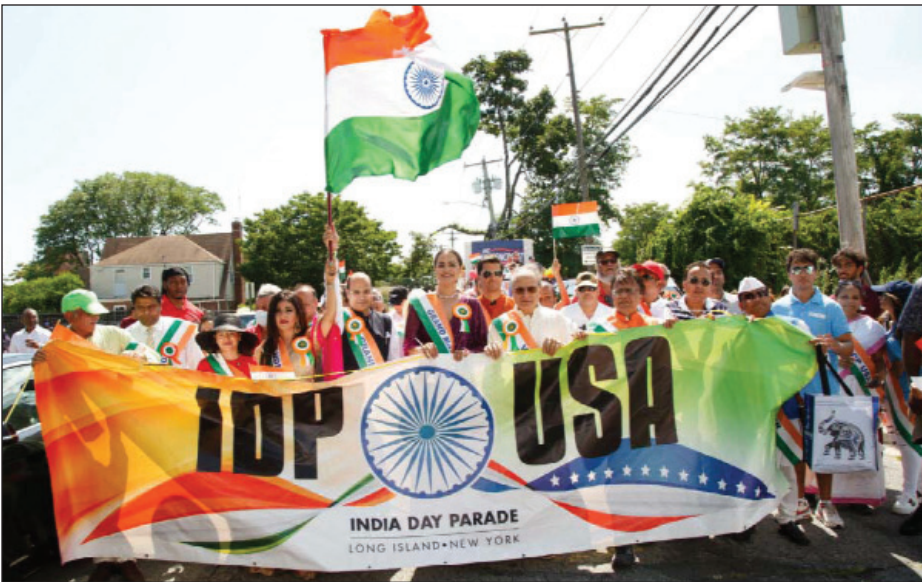
The 11th Annual India Day Parade.