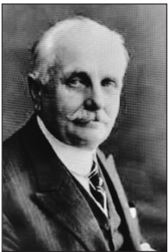
Circa 1915. Frank Winfield Woolworth