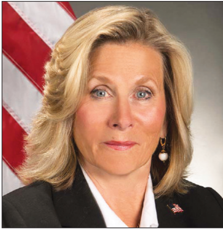
Glen Cove Mayor Pam Panzenbeck