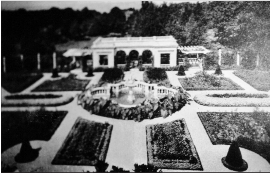
Circa 1920. Formal gardens on the Woolworth estate facing rear of the mansion.