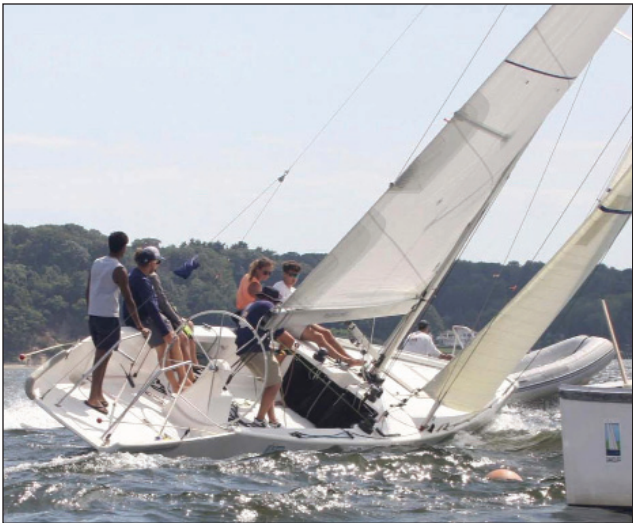
The Oakcliff Sailing Team.