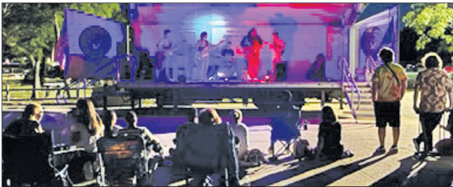
DCAL Quintet takes the stage at West Harbor Beach Bayville.