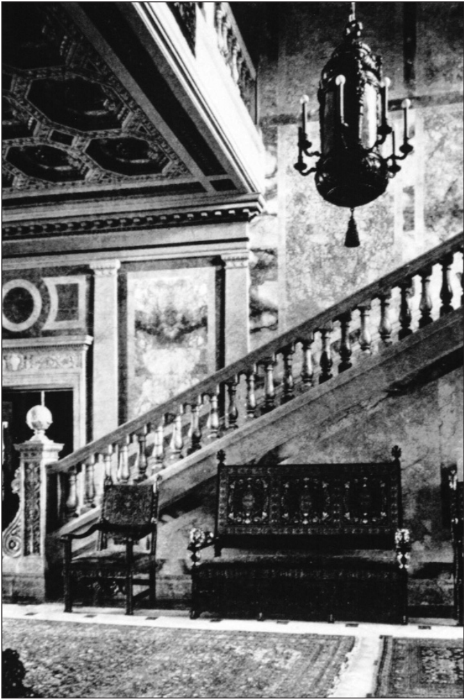
Circa 1920. Interior view of entrance hall, marble staircase and walls.