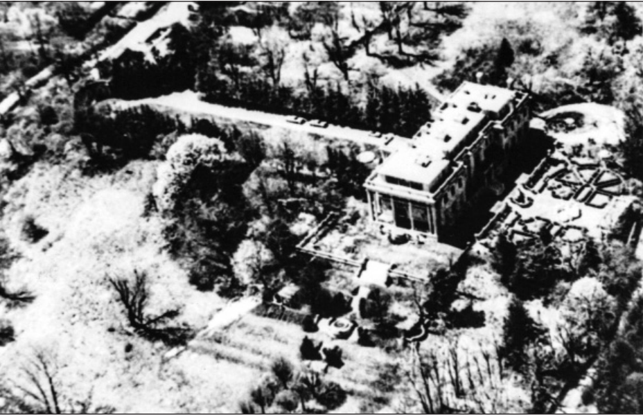
Circa 1980. Rare ariel view of the former Woolworth Mansion and surroundings in winter.