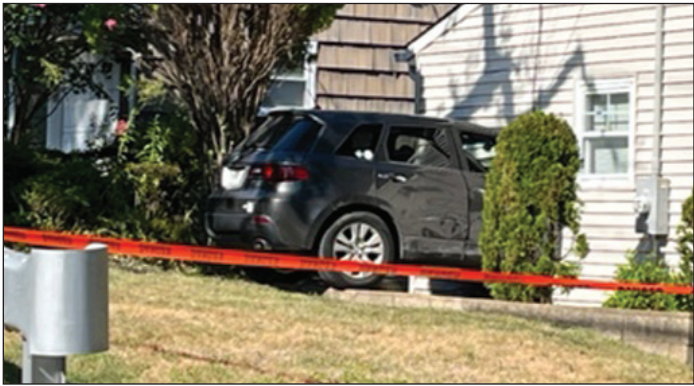
Vehicle stuck inside a home, on Godfrey and Moutain Avenue.

Monday August 15, approximately 3:30 PM a vehicle crashed into a home on Godfrey Avenue, Bayville. The driver of the vehicle was heading west up Godfrey Avenue, make a right turn onto Mountain Avenue, it kept going right, jumped the curb, just missing the guard rail, and hit the house.