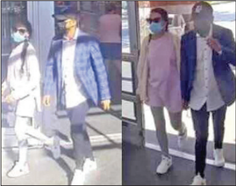
The robbery suspects.

July 21 at 2:38PM; the Costco at 625 Broadhollow Road, Melville, on July 21 at 12:45PM; the Bed, Bath & Beyond at 3083 Jericho Turnpike, East Northport, on July 21 at 1:30PM; the Costco at 625 Broadhollow Road, Melville, July 16 at 2:15PM; the Costco at 10 Garrett Place, Commack, on July 16 at 2:30PM; the Costco at 10 Garrett Place, Commack, on July 14 at 4:25PM; and the Costco at 625 Broadhollow Road, Melville, on July 14 at 2:30PM. Suffolk Police have asked the public to call their Crime Stoppers hotline at 1-800-220-TIPS (8477).